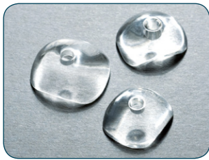
Conformer by Prof. Neubauer

Conformer are used for Orbita reconstruction. Shape and size must be decided individually by the doctor.